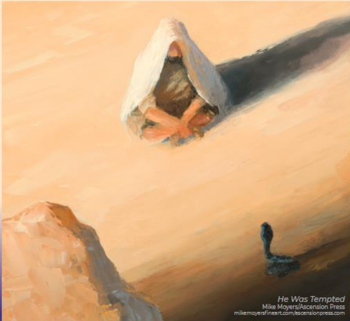
He Was Tempted