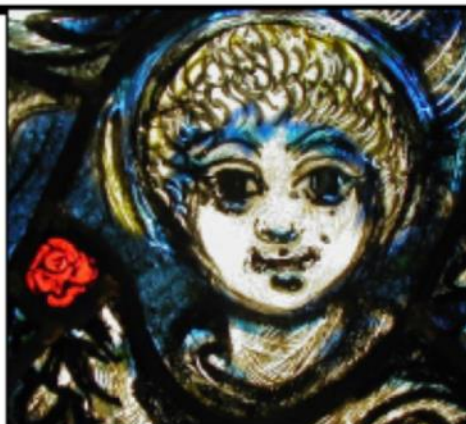
Every child brings us God's smile Pope Benedict XVI

October is Respect Life Month! Each week this month, a page in the bulletin will explore different aspects of Church teaching on a variety of life issues: abortion, human trafficking, war, and euthanasia. This week, we look at the Church's teaching on abortion.